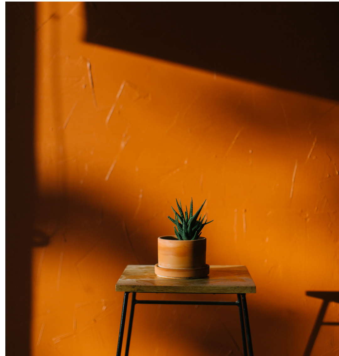
Dynamic direct light

This is what's so great about CSS; the light is SO dynamic! If you want even, gorgeous light, we recommend you coming in between the hours of 8am - 7pm from April -October, 8am - 5pm November - March. Either way, you are getting some pretty awesome light pretty much all day.