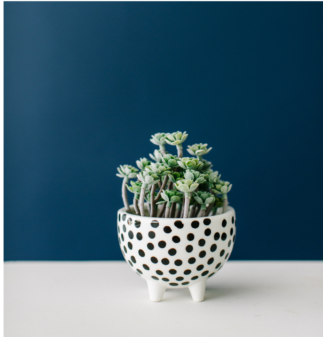
Even, glowing light