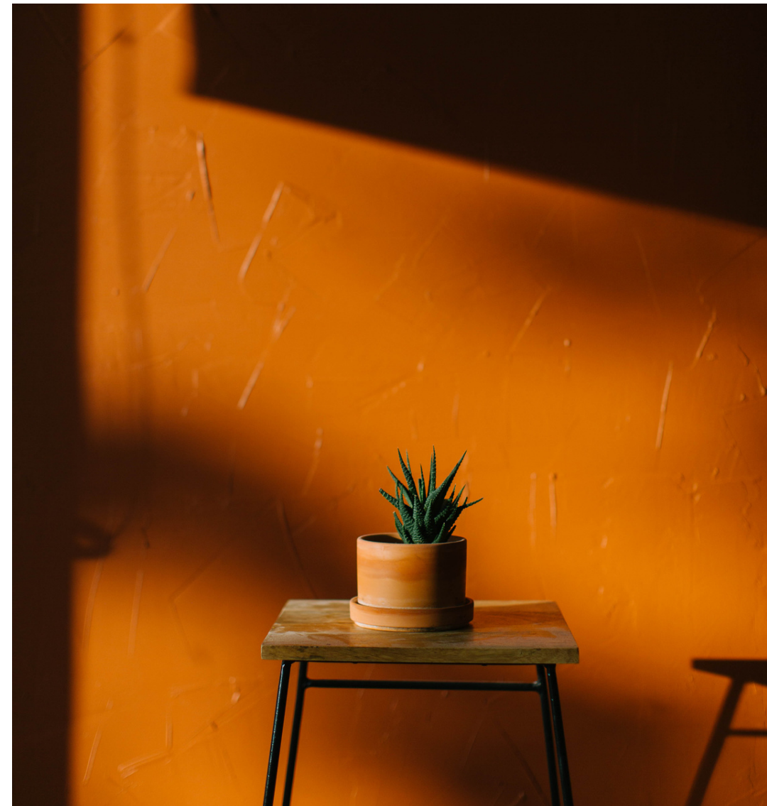
Dynamic direct light

This is what's so great about CSS; the light is SO dynamic! If you want even, gorgeous light, we recommend you coming in between the hours of 8am - 7pm from April -October, 8am - 5pm November - March. Either way, you are getting some pretty awesome light pretty much all day.